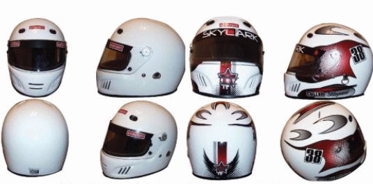
"Before / After" Helmet Wrap