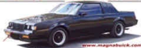
Turbo Buick

MAGNA Mid-Atlantic Grand National Association